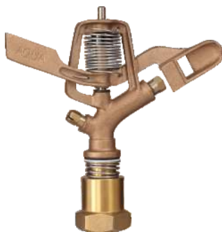
Female Threaded ( HT-25F )